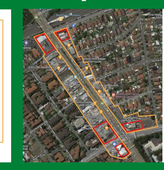
Residents Accept Increase in height from 5 storeys to 8 storeys for the 5 x gateway corner sites on King Georges Road.

Increase in height from 5 storeys to 6 storeys on King Georges Rd in the B2 zone between Stoney Creek Rd and the Railway line.